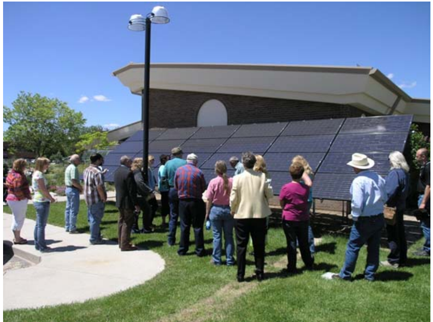
An example of a solar electric system at the Natrona County Cooperative Extension Office.

Education and your community can be quite important to family businesses, and an RE system can be part of your involvement. As many people value the attributes of RE, it may provide positive publicity through noting your products are produced with RE or to simply have a visible system (e.g. wind or solar) on your building. These systems can also be used to educate your community about where their energy originates (hint: it is not the outlet on the wall). In addition, some family businesses are simply fascinated by the ability to produce their own energy. Many systems use intriguing technology to harvest energy, and this can appeal to the technical interest of business owners. Similarly, with excellent wind and solar resources in Wyoming, some may feel compelled to harvest the energy, as if not used it feels like “leaving hay standing in the field.” Many of these educational and community values can help to change what a “cost effective” RE system is to your business.